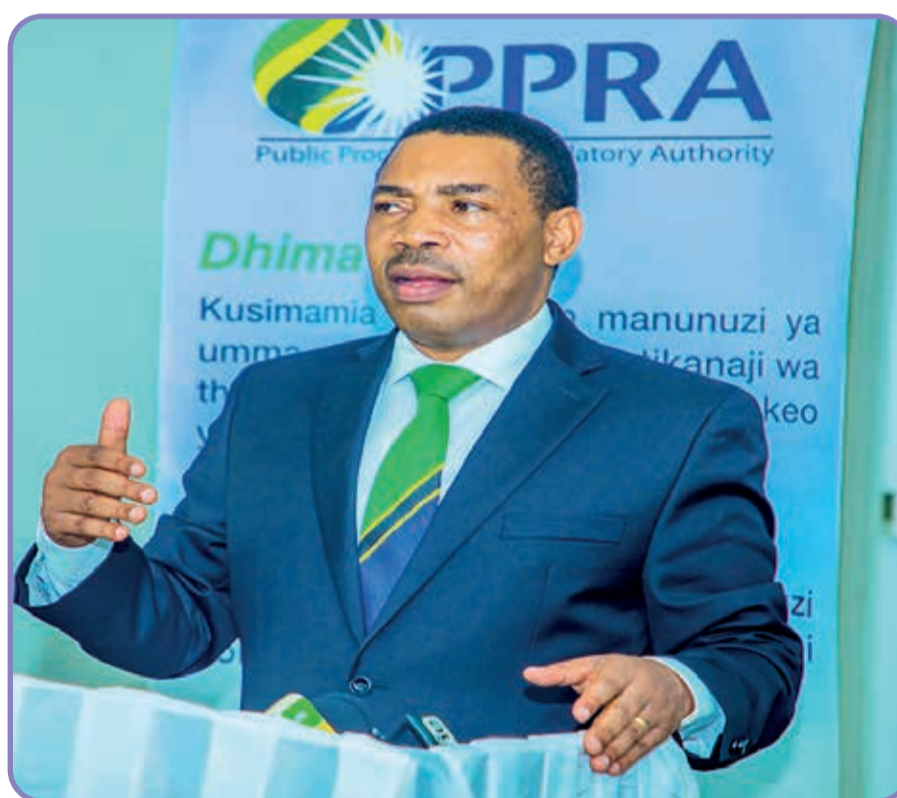
Minister for Finance and Planning, Hon. Dr. Mwigulu Nchemba